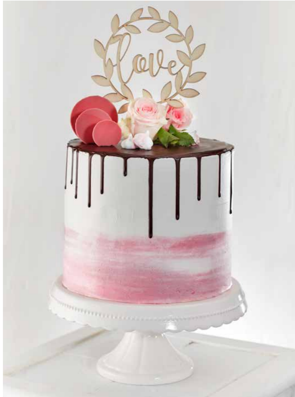
A picture-perfect cake – thanks to the combination of ombre with a melt-in-the-mouth chocolate drip.